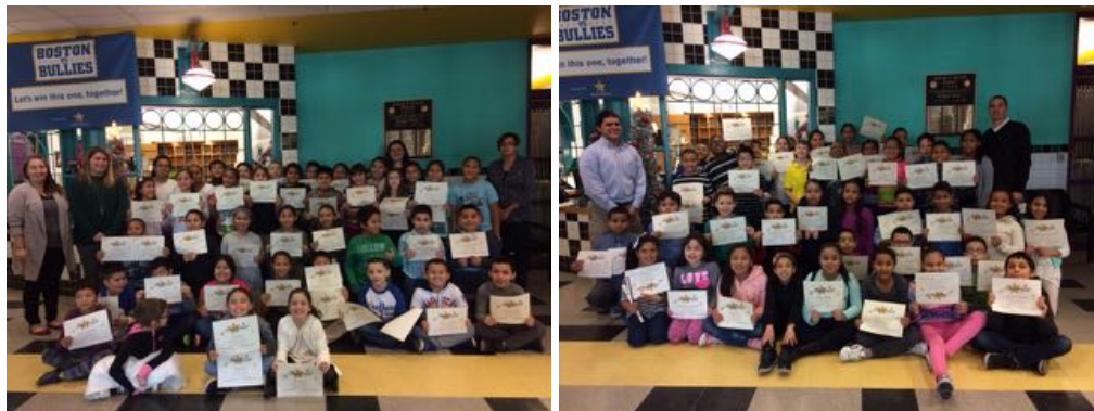
Fun at the Hooks School Papa Gino's Night

On Tuesday, December 6, 2016, 77 Hooks School students were honored for their achievement in the 2016 PARCC assessment. The entire Hooks School community celebrated this event as we continue to maintain our Level 1 status. In addition, we have been designated as a Commendation School.