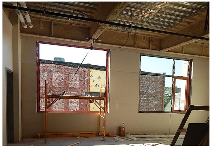
6) Installing 3 rd floor windows