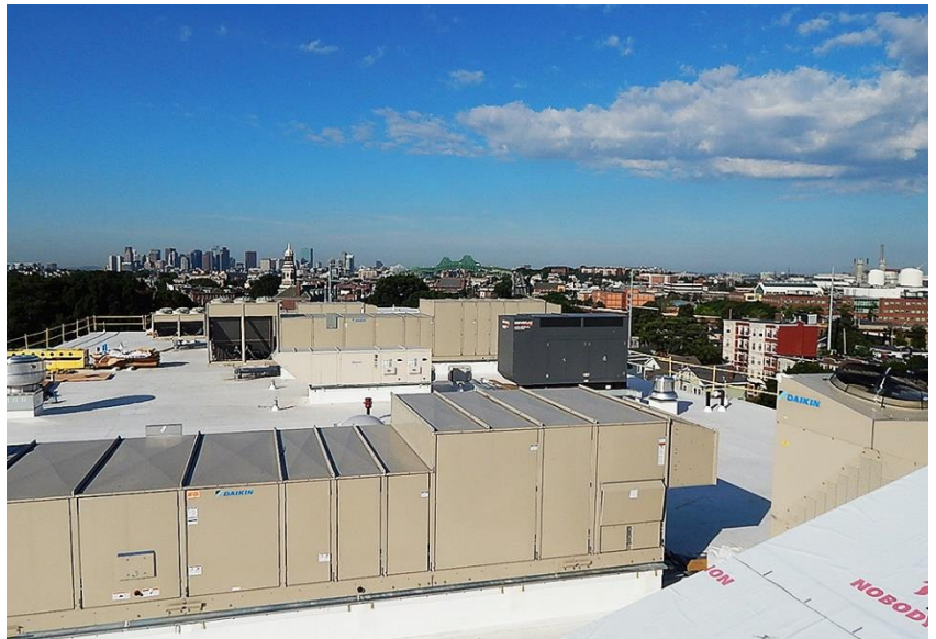
8) View from the roof 7/1/16