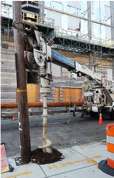
7) Verizon installing pole on Tudor