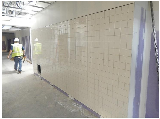
4) 1 st floor tile in corridor