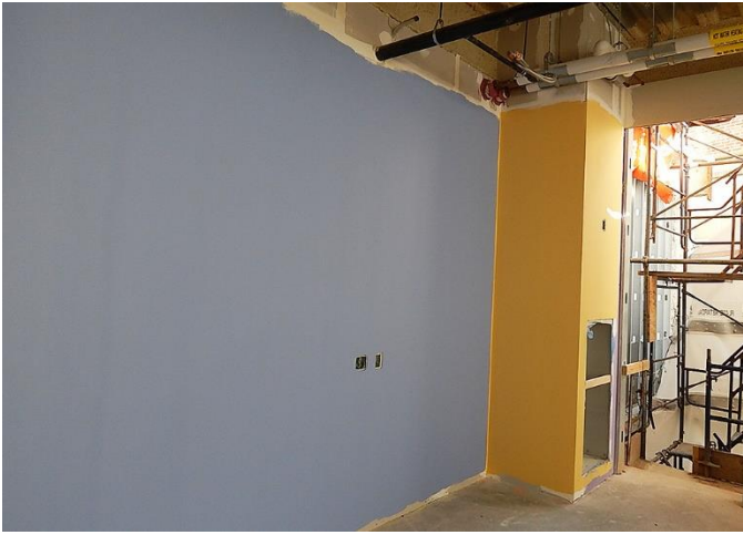
3) :Painting Room 319