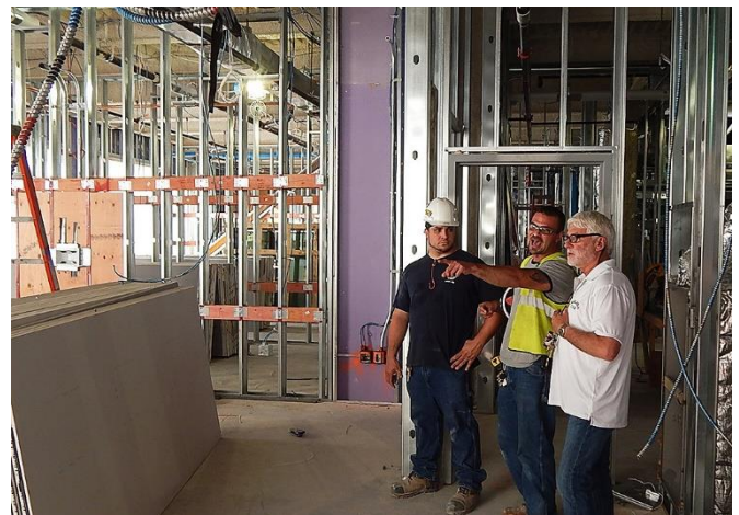
2) Electrical inspection 4 th floor