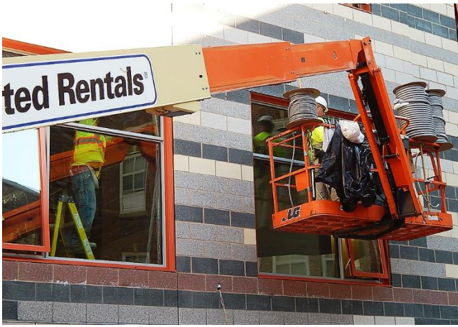
5) Caulking windows east end 1 st floor